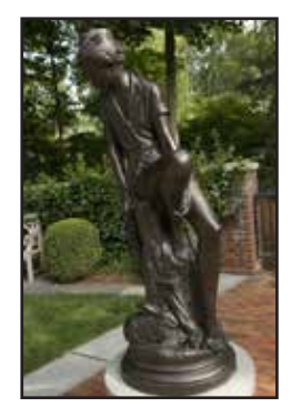
1928, recast and installed 2000 Perrot Memorial Library